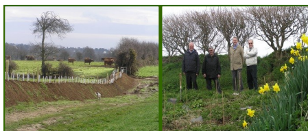
Images from the planting season. Far left: a new hedgerow being created. Centre: Representatives from HDFT inspecting planting. Left: new planting in the plastic countryside!

We were grateful for the help of Citibank who planted over 400 trees in order to celebrate their 200th Anniversary. We hope to welcome them back later in the year to help maintain