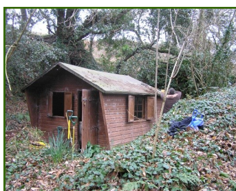
Refurbishment of the shed at Val de la Mare gets underway. The Forgotten Forest Open Days are on June 9th and 10th. Please see back page for more detailed information.

I reiterate the previous request as to whether you are involved in any businesses or have friends who are and can help; we would be delighted to hear from them. It is a joint effort in which I hope as a member, you will join with us and possibly consider a personal donation in view